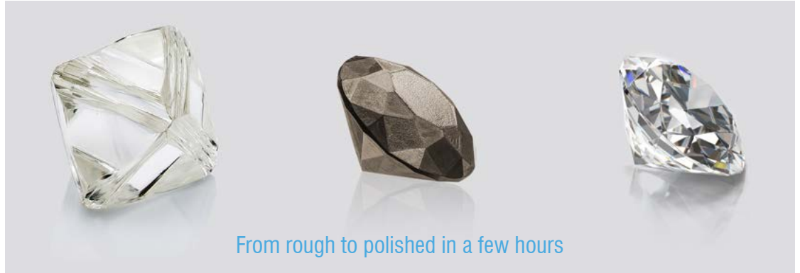
From rough to polished in a few hours

A short manual polishing operation is needed to remove the