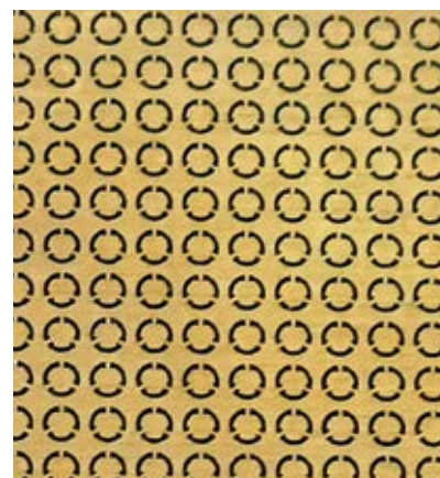
A spinneret structure in a thin metal sheet

(OxOx-CMCs). These materials consist of high-grade ceramic fibers embedded in a ceramic matrix. They are primarily used in aerospace because of their excellent thermal resistance with good high temperature strength and low weight, and compete with titanium materials and other high-temperature alloys. Equally easy to process are carbon fiber composites as well as numerous other ceramic materials, some of a particularly complicated composition, that are used in the production of power semiconductors or sensors, as well as diamond grained composites. These consist of diamond grains embedded in a metal or ceramic matrix and are used in contoured grinding wheels or watch cases that display high resistance to scratches and other damage through the diamond grains. The semimetal silicon and the ceramic silicon carbide are also of growing interest. An example of an application is for solid silicon discs up to 10 mm thick. These are drilled with precisely placed and dimensioned holes for the production of silicon chips. An exact amount of an aggressively reactant gas is fed through these holes onto the wafer.