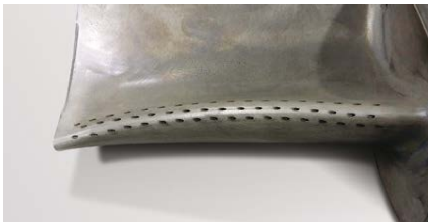
Numerous openings to the hollow interior of the blades in modern gas turbines provide cooling for the blade surface