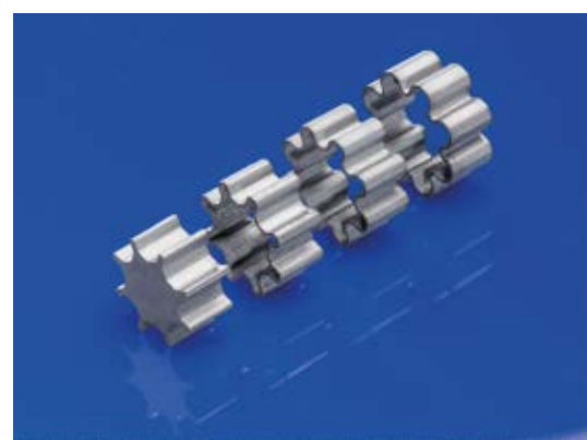
These filigree structures were cut from a thick sheet of silicon carbide using the LMJ technique

As with every other groundbreaking development, the LMJ technology is also